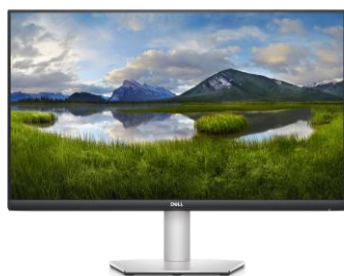
Dell 27 4K UHD Monitor - (U2720QS)