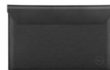
Dell Premier Sleeve - XPS 17