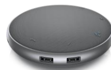
Dell Mobile Adapter Speakerphone | MH3021P