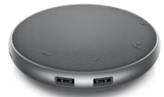
Dell Mobile Adapter Speakerphone | MH3021P